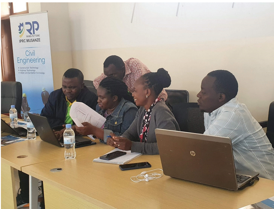
Fig. 3 - Alcuni partecipanti durante l'esercitazione pratica.

And we hope to have the opportunity to organize again similar activities in such a welcoming and enthusiastic country!